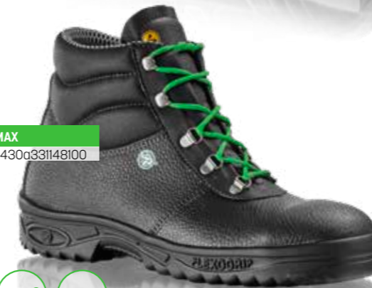
→ MAX ART. NO.: s0430a331148100