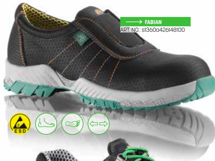
→ FABIAN ART. NO.: s13600a426148100