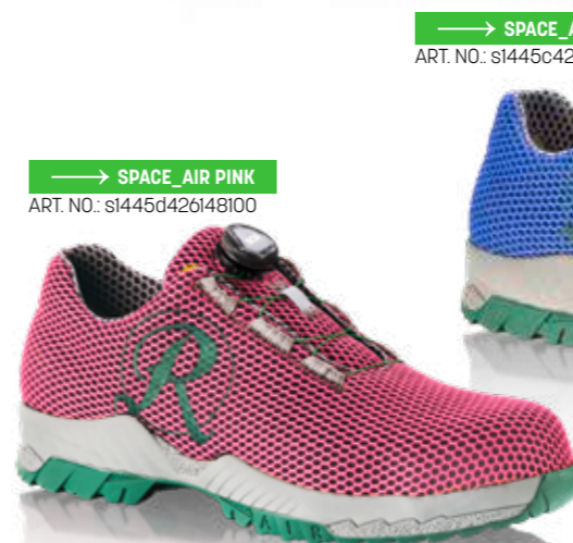
→ SPACE_AIR PINK ART. NO.: s1445d426148100