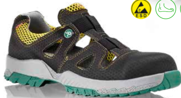
→ TOBIAS ART. NO.: s1340a426148100