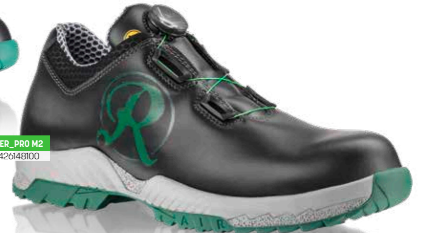
→ LEATHER_PRO M2 ART. NO.: s1440k426148100