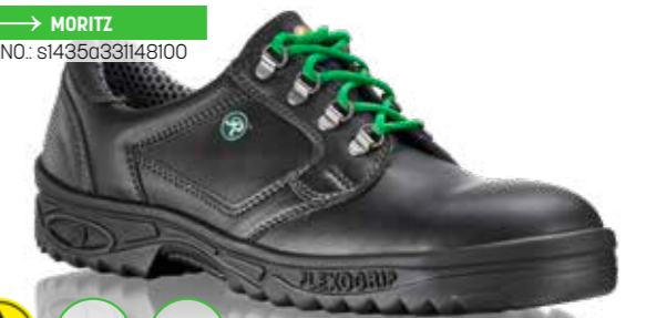
→ MORITZ ART. NO.: s1435a331148100