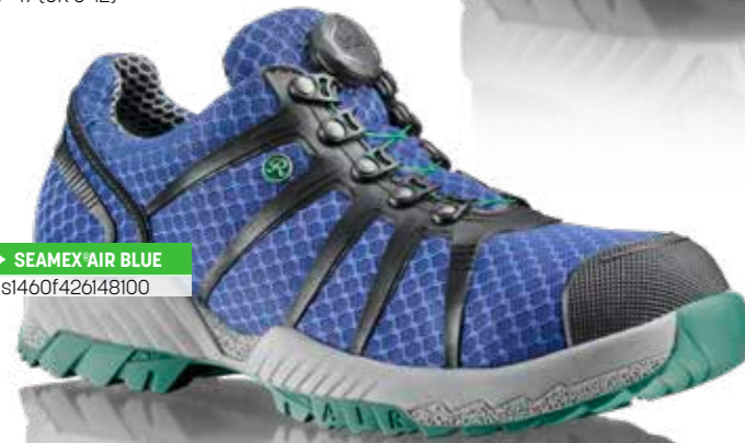
→ SEAMEX AIR BLUE ART. NO.: s1460f426148100