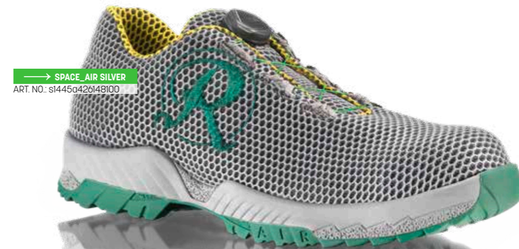
→ SPACE_AIR SILVER ART. NO.: s1445c426148100