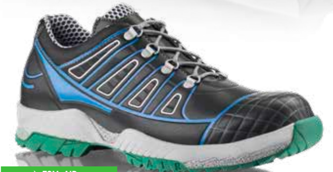
→ TOM AIR ART. NO.: s1440b426148100