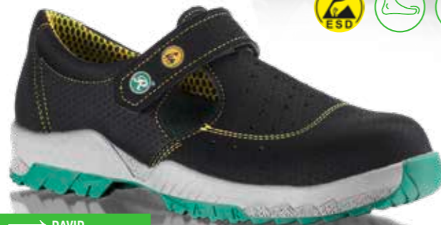
→ DAVID ART. NO.: s1341a426148100