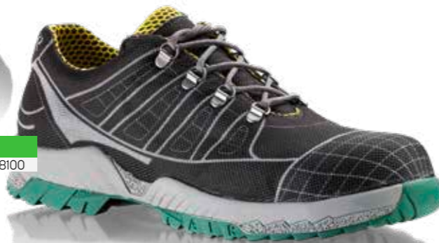
→ JUST AIR ART. NO.: s1440j426148100