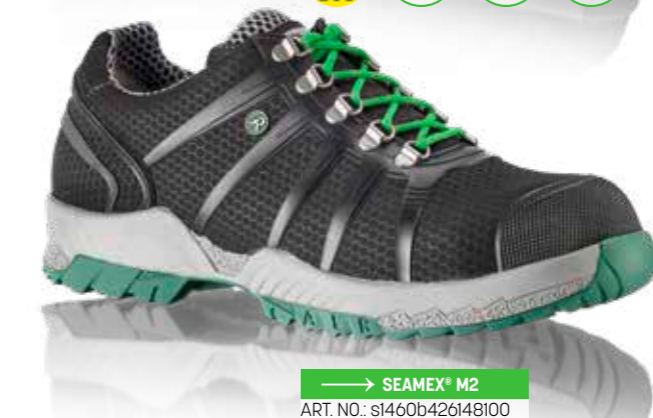
→ SEAMEX® M2 ART. NO.: s1460b426148100