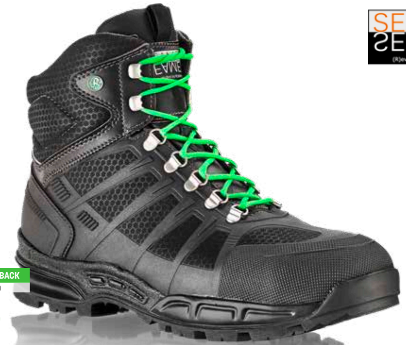
→ SEAMEX® M2 OUTBACK ART. NO.: s1460e121145100