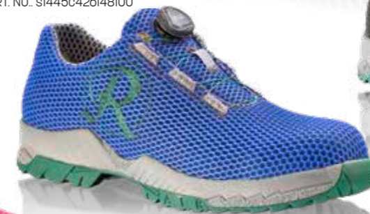
→ SPACE_AIR COBALT ART. NO.: s1445c426148100