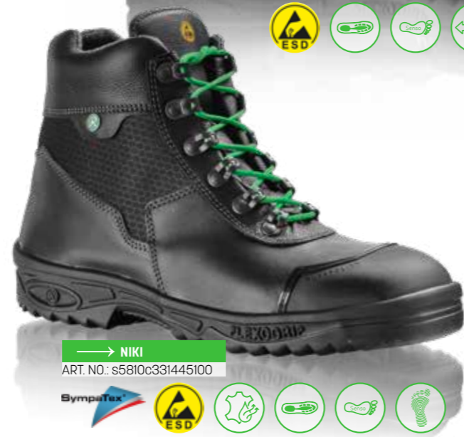
→ NIKI ART. NO.: s5810c331445100