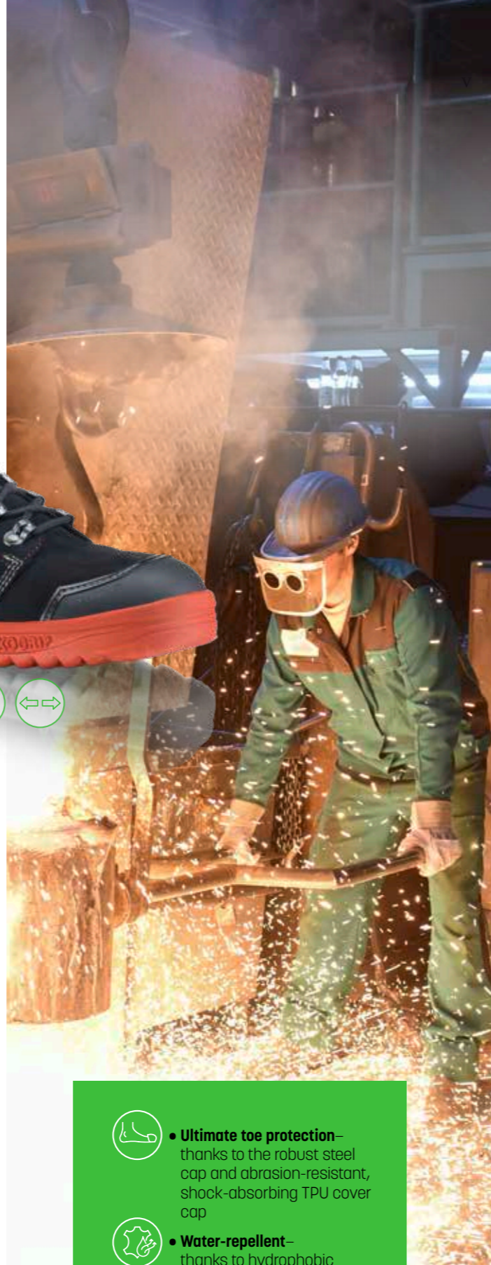
→ EASY GO_HOT ART. NO.: s6000b351448200