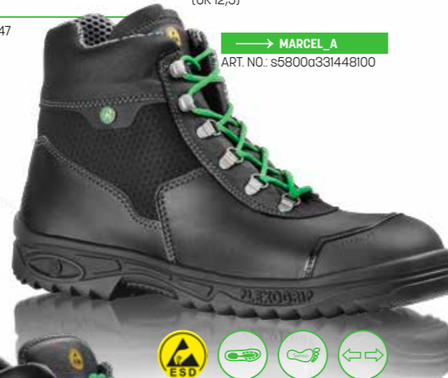
→ MARCEL_A ART. NO.: s5800a331448100