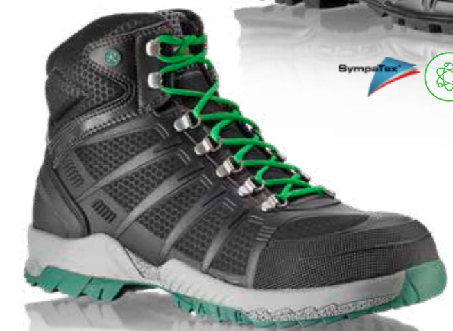
→ SEAMEX® M1 ART. NO.: s4600b426448100