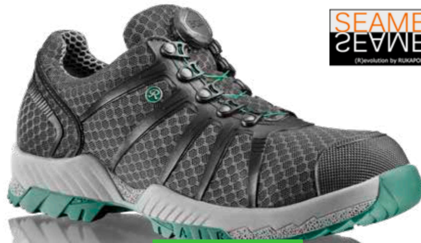
→ SEAMEX AIR ANTHRACITE ART. NO.: s1460g426148100