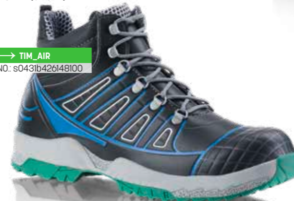
→ TIM AIR ART. NO.: s0431b426148100